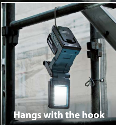
Hangs with the hook

Compact design for easy attachment in tight spaces