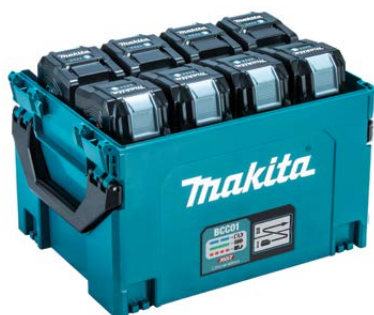
MAKPAC type Battery Charging Case with multiple charging ports for LXT batteries