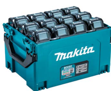
MAKPAC type Battery Charging Case with multiple charging ports for XGT batteries