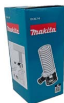
1914L7-6 for drilling work