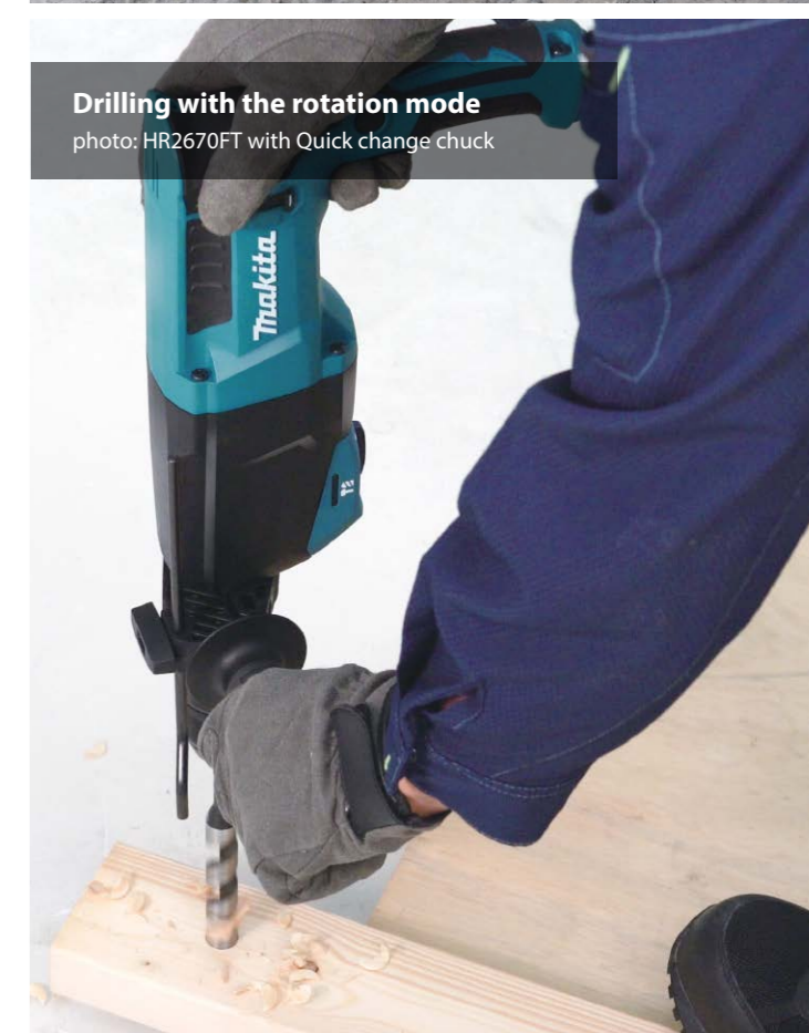
Drilling with the rotation mode photo: HR2670FT with Quick change chuck