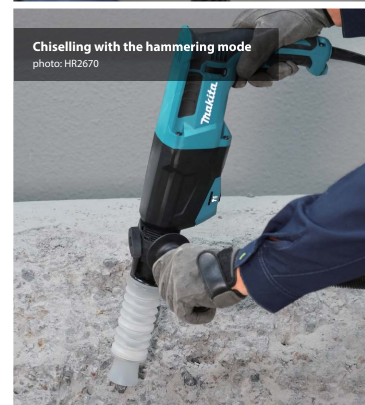
Chiselling with the hammering mode photo: HR2670