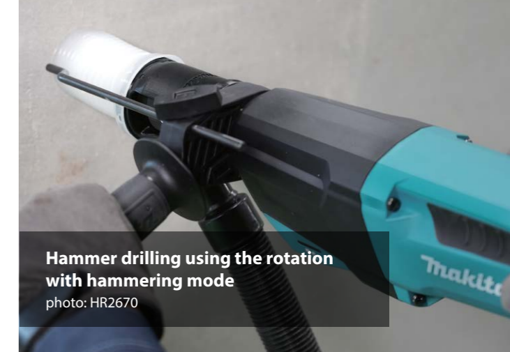
Hammer drilling using the rotation with hammering mode photo: HR2670