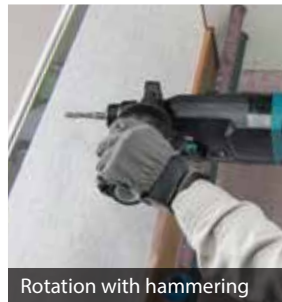
Rotation with hammering