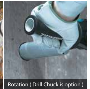
Rotation ( Drill Chuck is option )