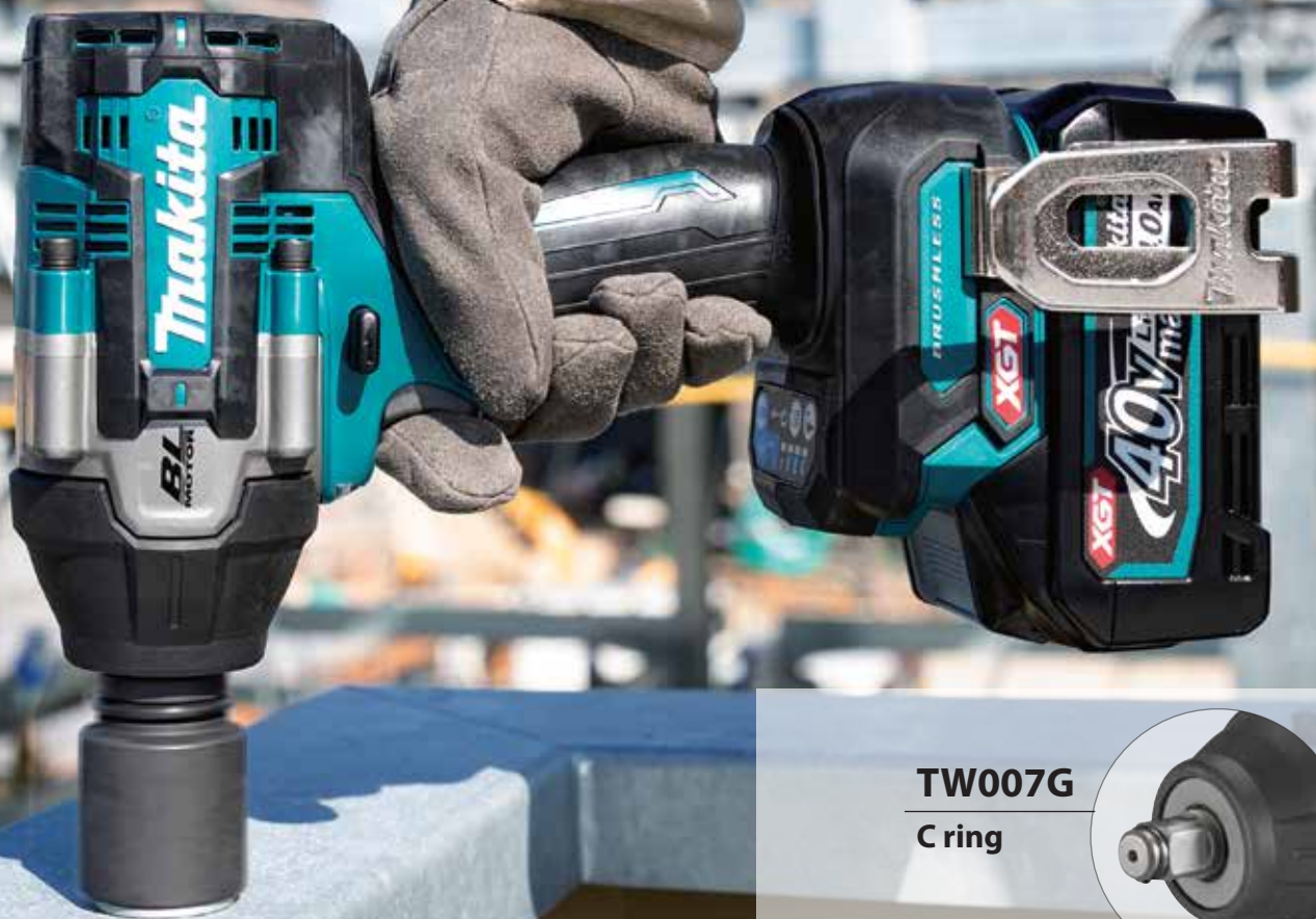
TW007G C ring