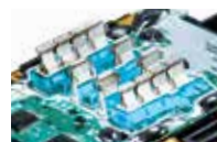
Terminal short-circuit prevention structure