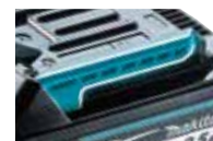
High Rigidity Battery Rails