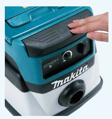
Large on-off switch

• allows for easy on/off switching. • functions only when Main power switch is on to prevent accidental switch-on during transportation, etc.