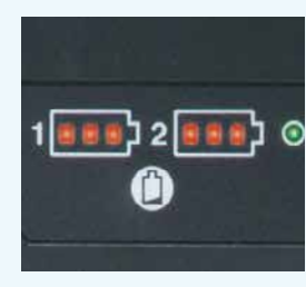
Dual battery fuel gauge

• allows for easy on/off switching. • functions only when Main power switch is on to prevent accidental switch-on during transportation, etc.