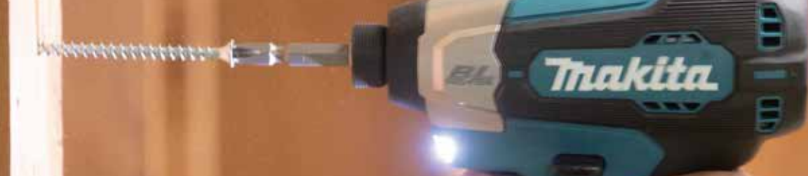
Bit is option