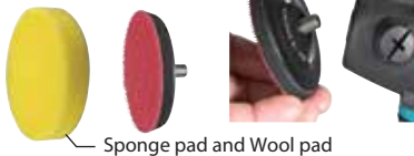
Sponge pad and Wool pad

Diameter: 75mm Easy to change Hook & Loop style Part No. 743125-4