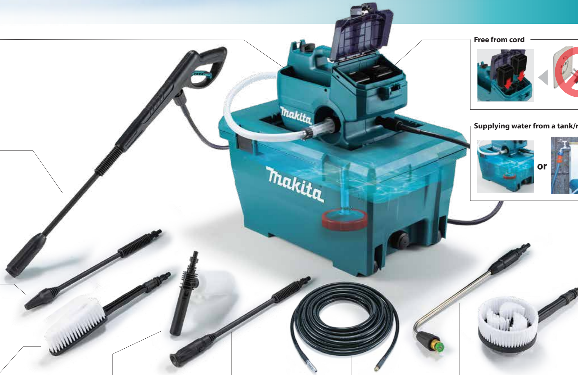
Free from cord