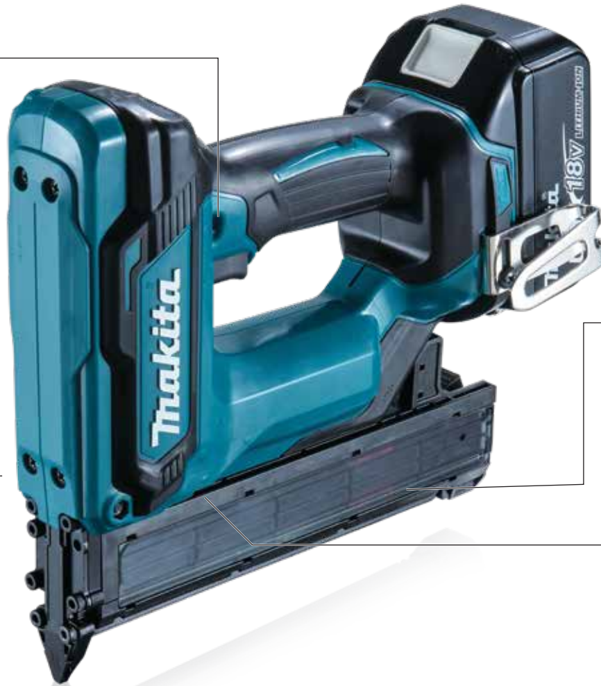
Good tool balance