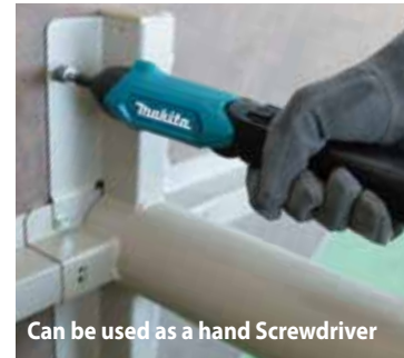
Can be used as a hand Screwdriver

Can be used as both of straight style and pistol style