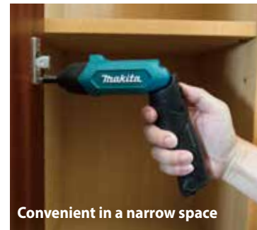
Convenient in a narrow space