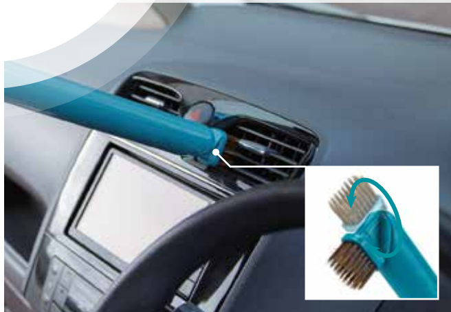
Soft brush 360