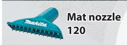
Mat nozzle 120