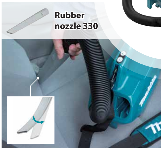
Rubber nozzle 330