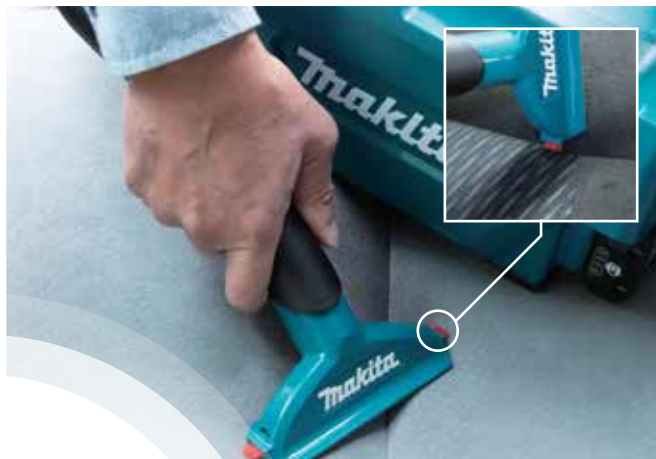
Seat nozzle 120