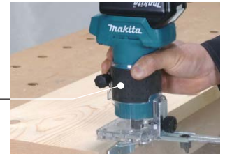
*With Fine depth adjustment